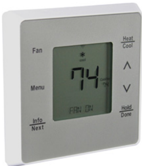
Fig. 2 - Côr 5 / 5C Programmable Thermostat