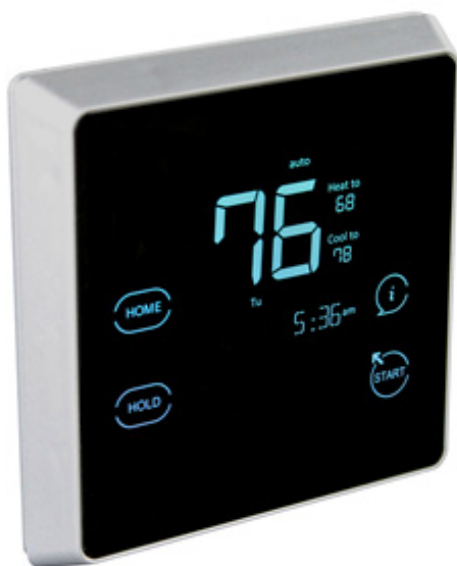
Fig. 1 - Côr 7 / 7C Programmable Thermostat